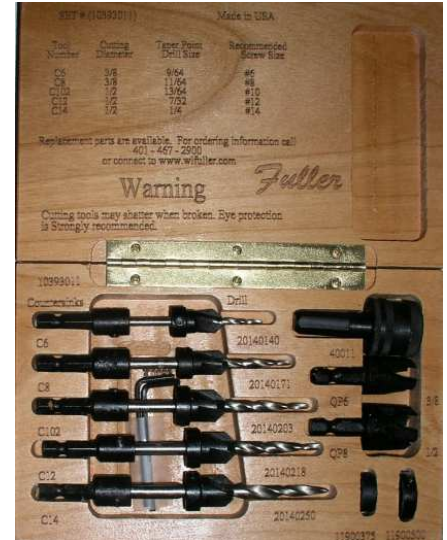
Organized and Protected in a tooled solid mahogany case