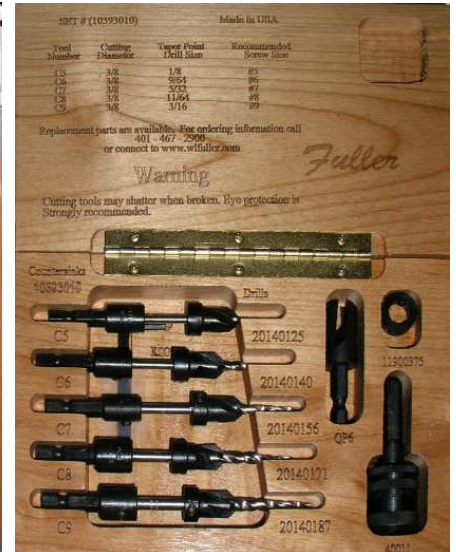
Organized and Protected in a tooled solid mahogany case